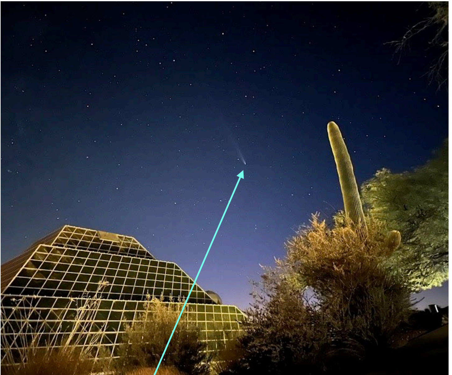
Comet A3 sighted above Biosphere 2