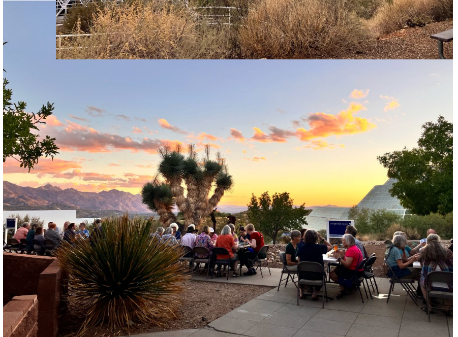
Above: research on coral reefs Dinner at sunset