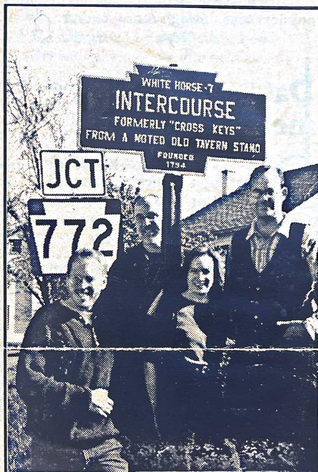
Sex Chordæ enjoying Intercourse, Pa.

But life was not all business in Lancaster. The consort was afforded ample free time to take in the sights and cuisine of the local scene. We enjoyed fried oyster sandwiches, crab cakes and