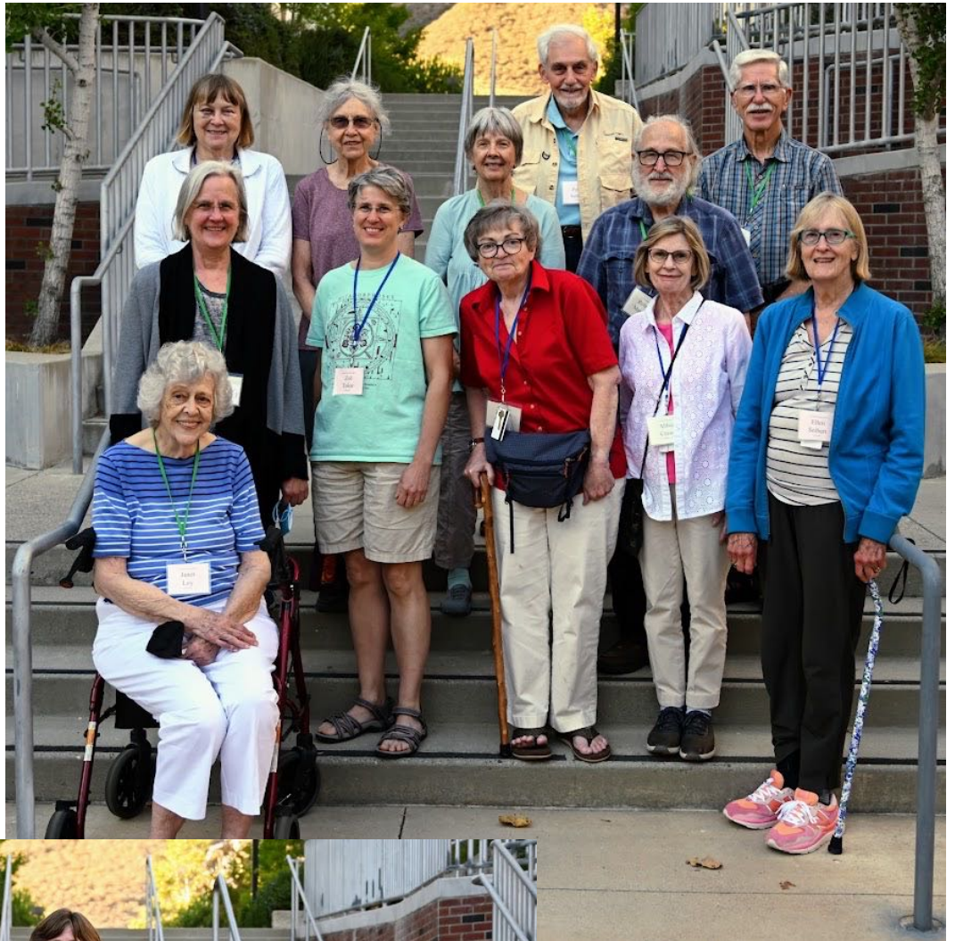
At right: Gambists from the Pacific Northwest