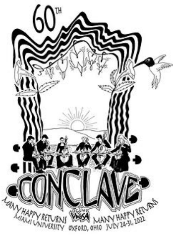
An evening consort session

https://www.earlymusicamerica.org/web-articles/a-happy-return-at-viola-da-gamba-societys-conclave-2022/