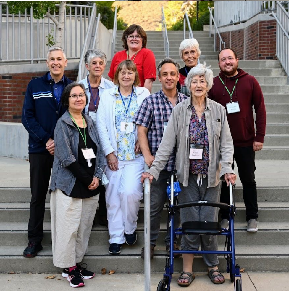
At left: Folks from the Southern California chapter of VdGSA