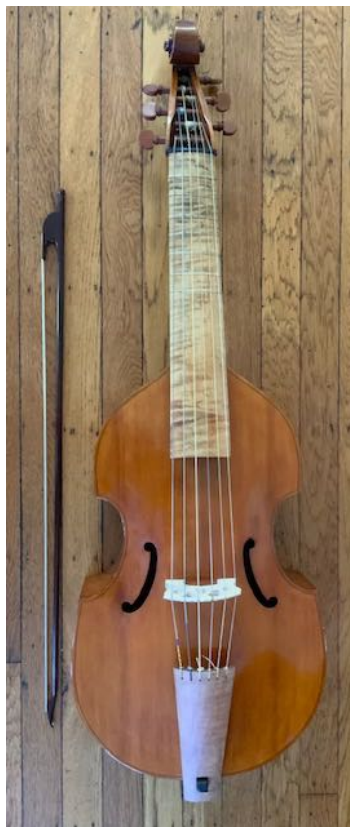
Tenor viol and bow