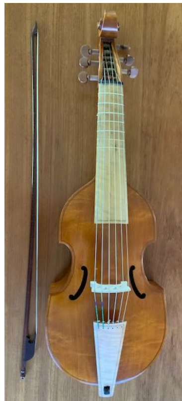
Treble Viol and Bow