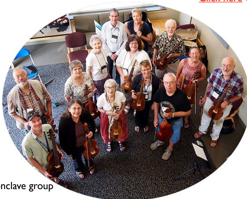
A recent Conclave group