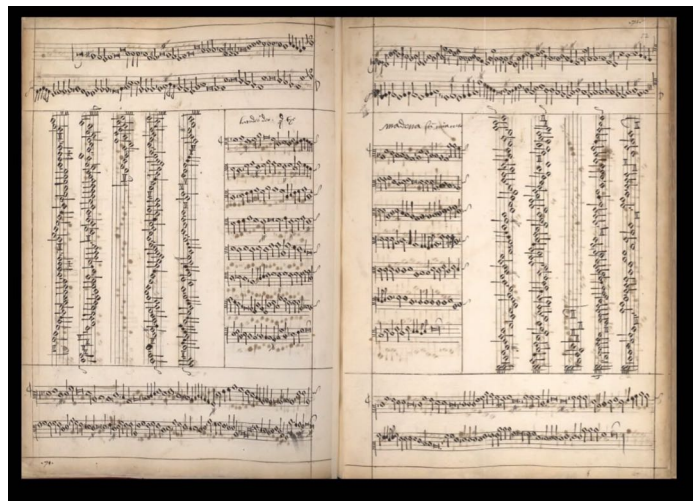
Renaissance part book

Chair, Emerging Artists Fund Committee Berkeley Piano Club