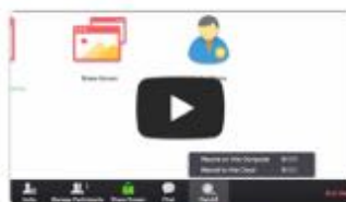
Record a Meeting