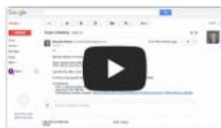
Join A Meeting