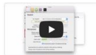
Joining & Configuring Audio & Video