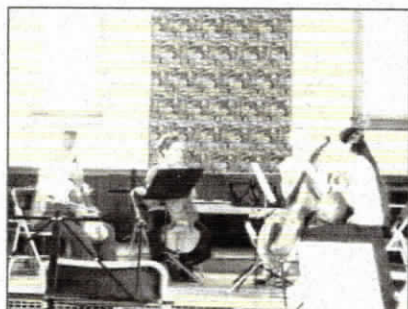
Zice Viols, June 9, 2007