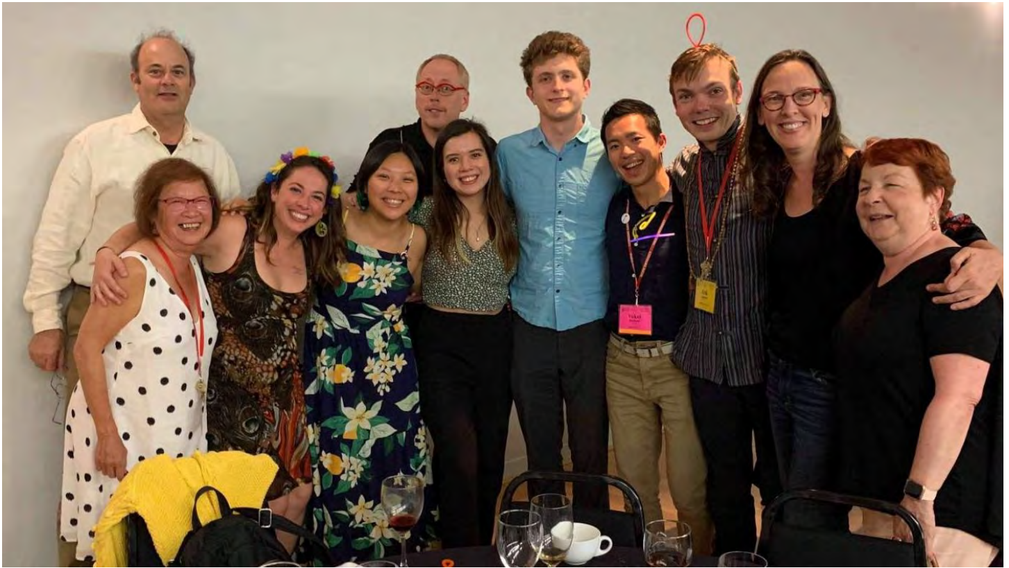
Some of the Bay Area teachers and students attending Conclave