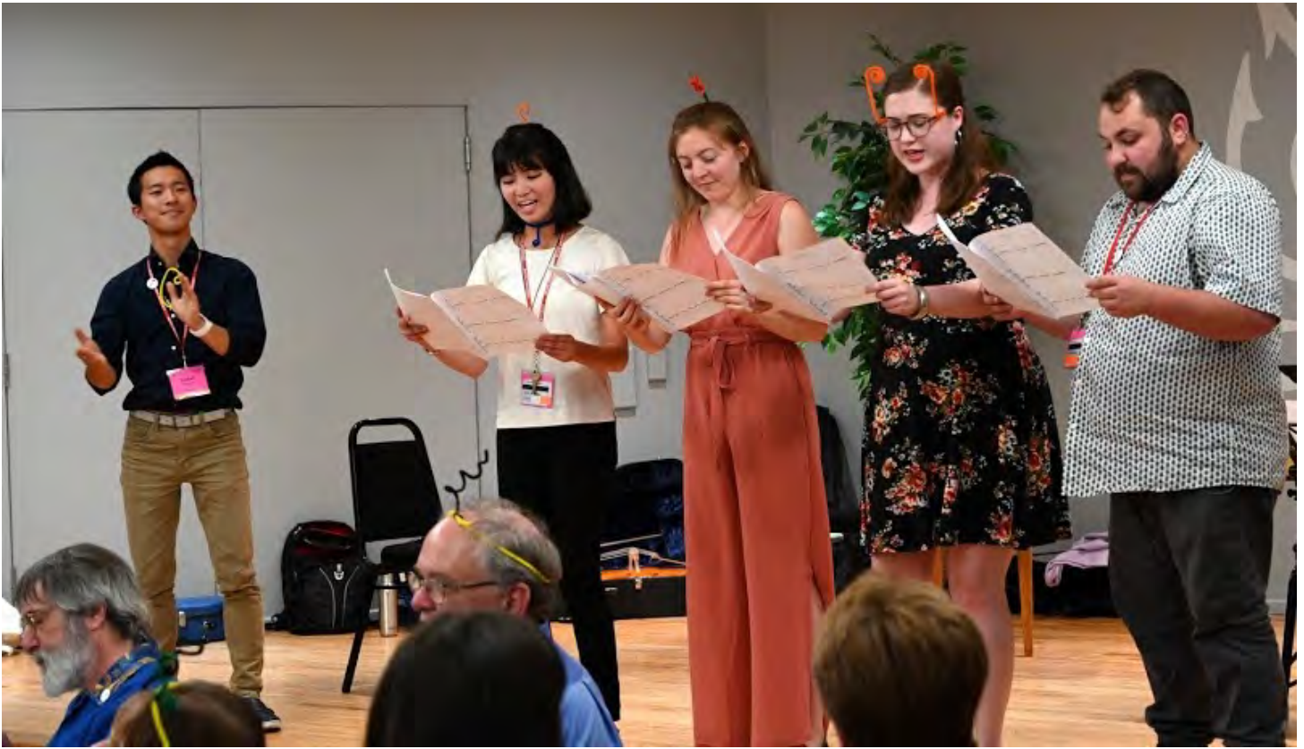
“Gamba Legs”– a hilarious fast-paced spoken word piece performed at the banquet