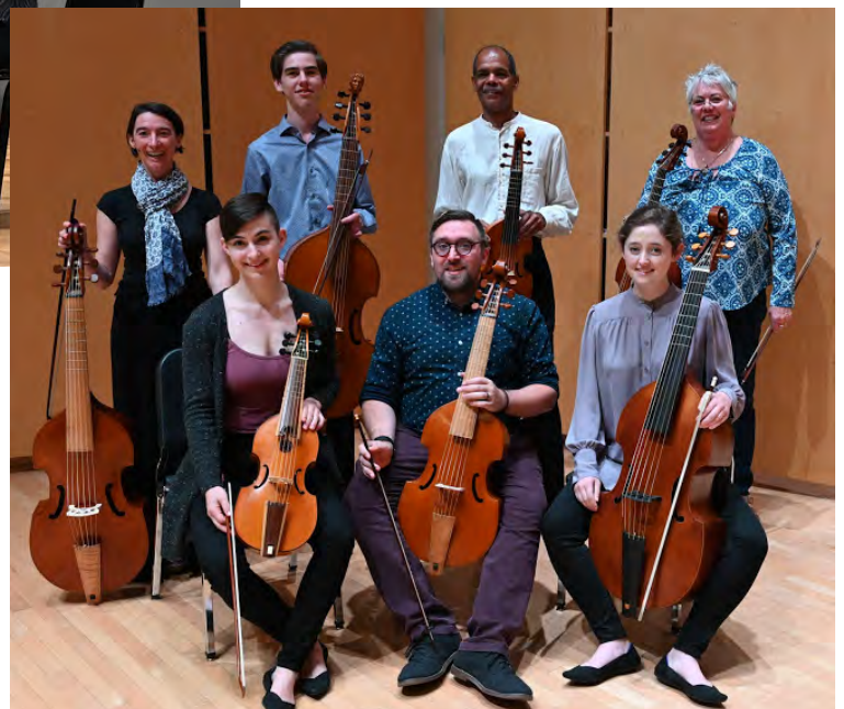
The Consort Co-op