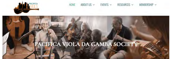
About the Chapter

The Pacifica Viola da Gamba Society (PvdGS; also known as “Pacifica Viols”) is an association of viol enthusiasts in the broader San Francisco Bay Area, one of the most active early music centers in the U.S. Members include players (from novice to advanced), instrument makers, teachers and performers. If you love the music of the viola da gamba, or want to learn more about it, consider joining the Pacifica Viola da Gamba Society. Member benefits include: