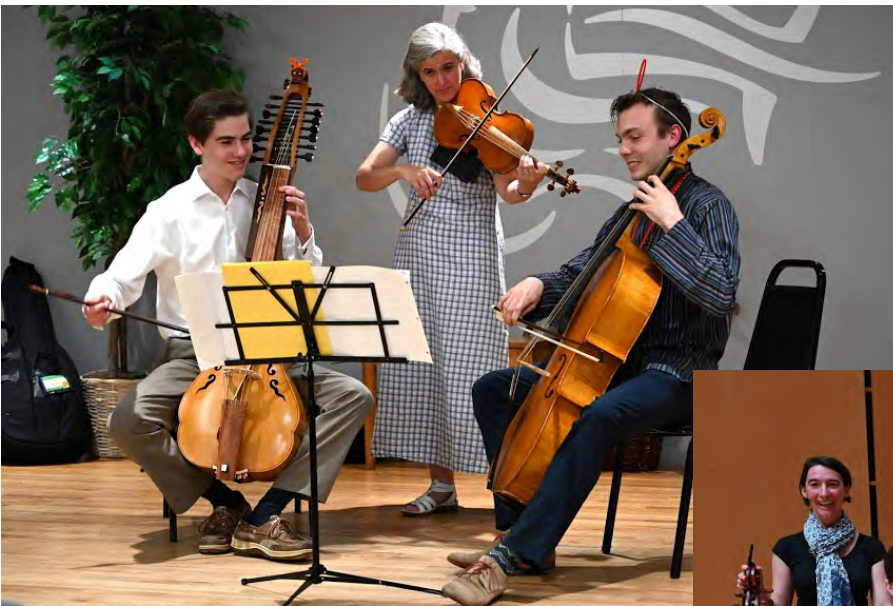
Banquet entertainment including a baryton (at left)