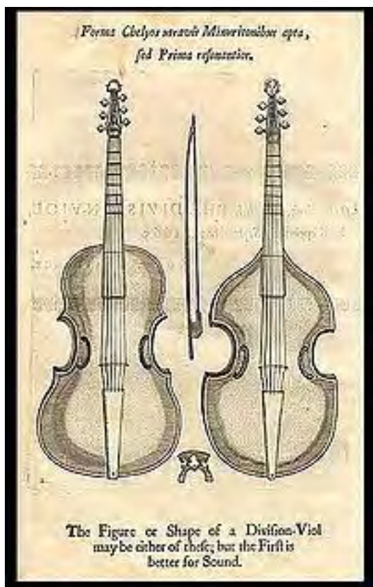
Caption: "The Figure or Shape of a Division Viol may be either of these, but the First is better for Sound."