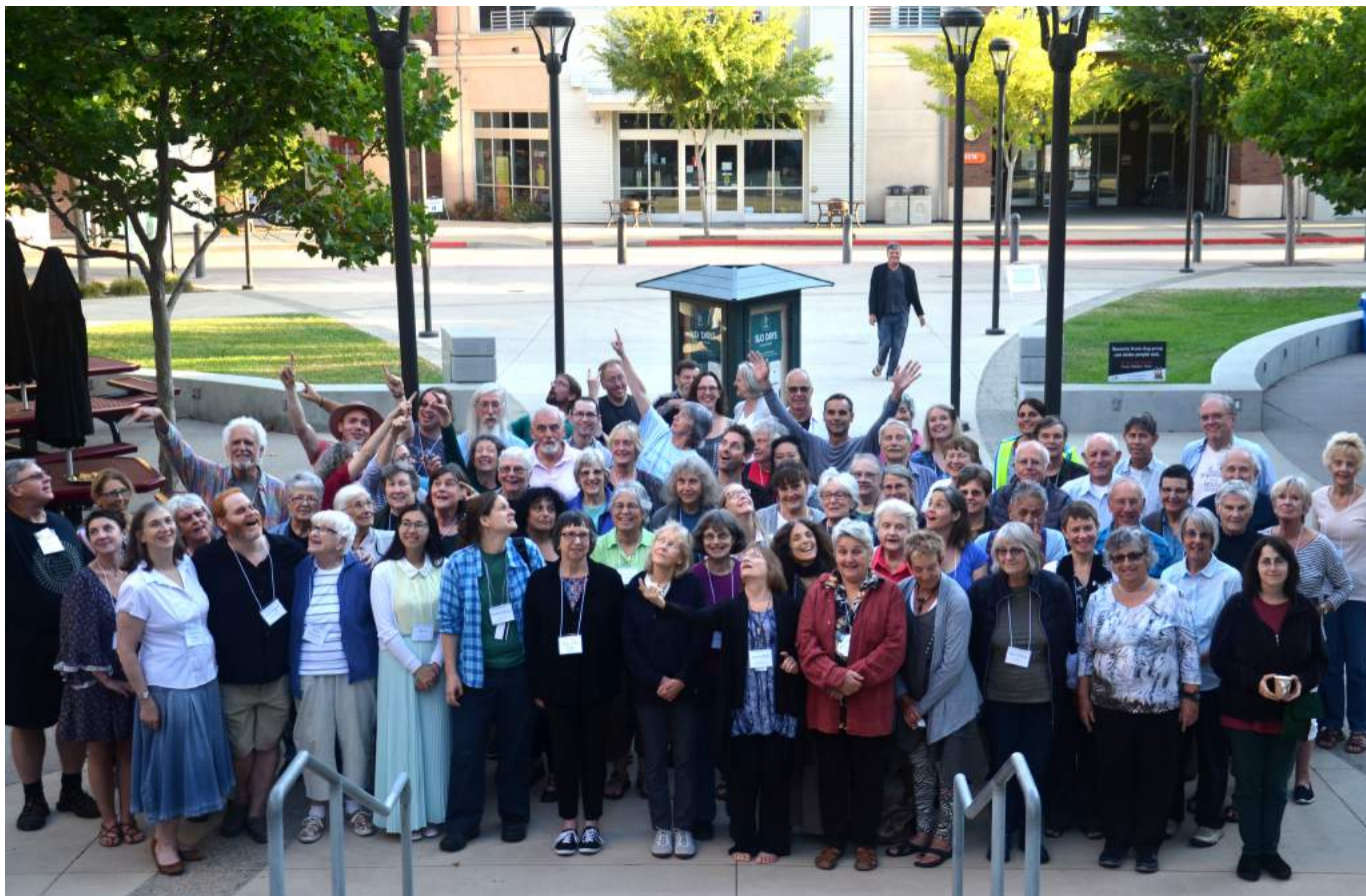
Above: The whole Viols West gang