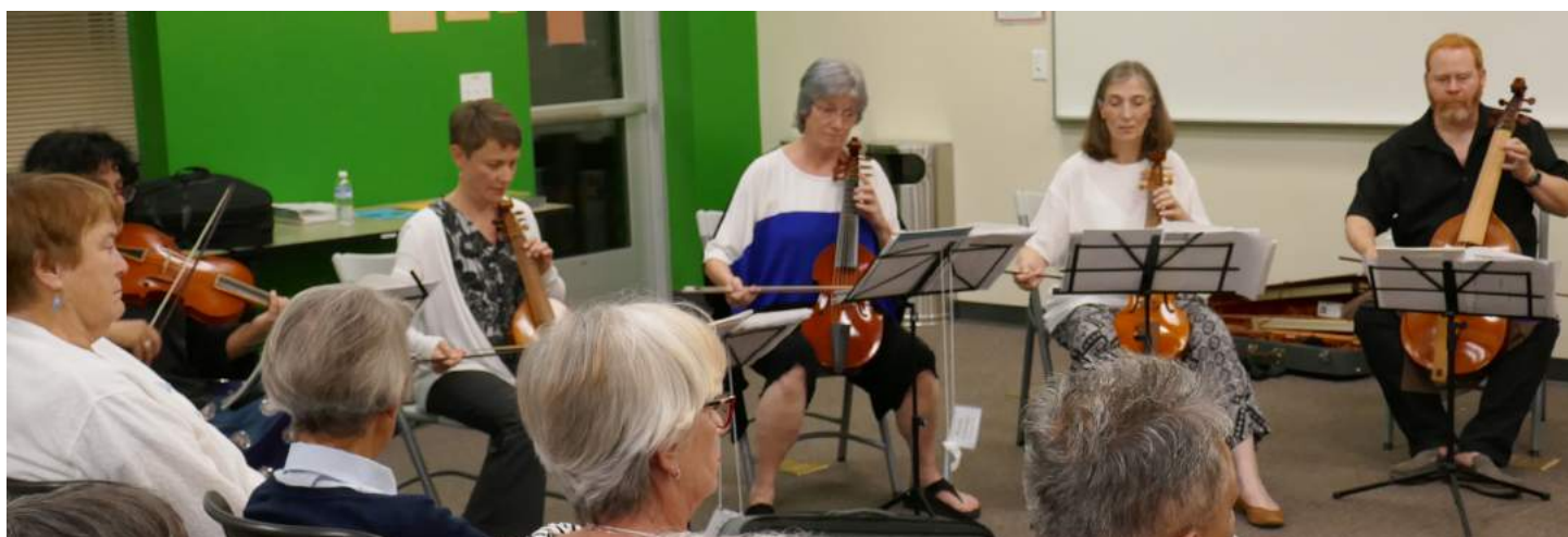
Viols West Faculty concert

The VdGS Pacifica Chapter is an Affiliate of the San Francisco Early Music Society, and "Gamba News- Pacifica" is our official newsletter.