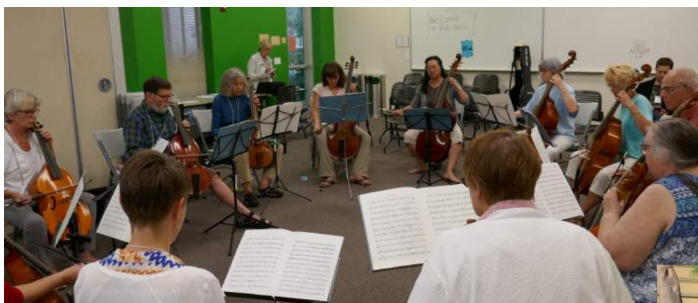
Left: Evening Lawes reading session

Did you see this guy at the Thursday Farmers' Market in San Luis Obispo? "THE (reverbed & looped) LORD OF THE CELLO "! Blonde locks flowing, his rugged face to the sun, loving every minute of it! What do you think could we convert him?