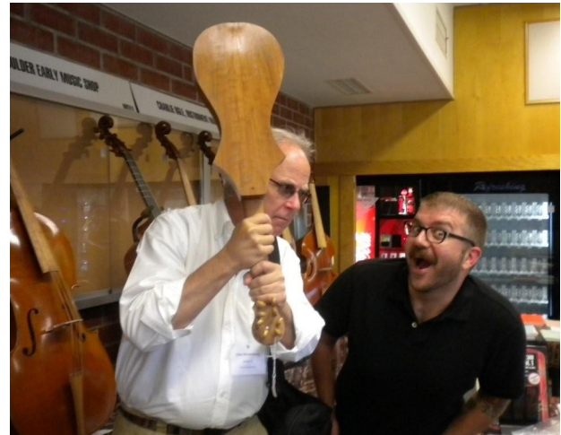
A brief splintering over technical issues