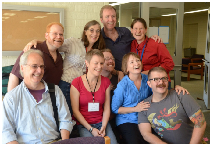
The all-faculty smiling event (aka, last day)