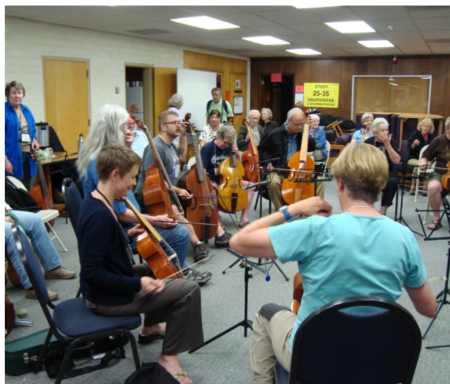
On three evenings, faculty and students doubled on consort parts

Pacifica Chapter's first Viols West was a huge success August 7-13, in San Luis Obispo.