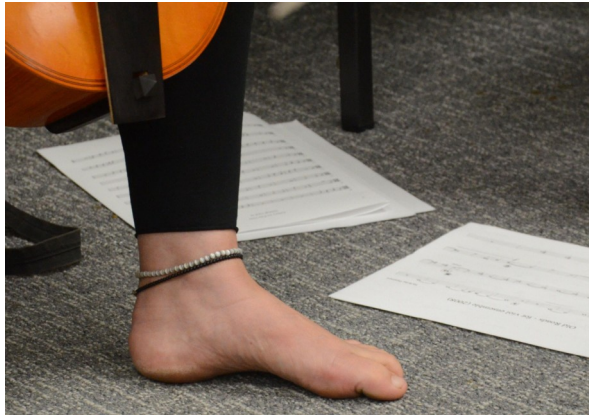
Trilby's left foot?